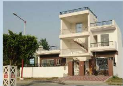
PRIVATE HOUSE ON PLOT