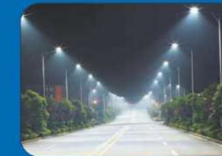
LED Street Lights

Walking distance from Ansals Galleria (Commercial) in Ansal Town, Yamunanagar Land (1.28 Acres) given to authorities for Community Facilities