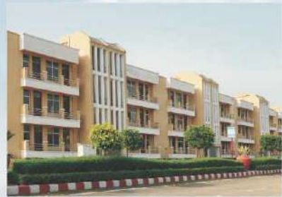
MAJESTIC FLOORS - G+2