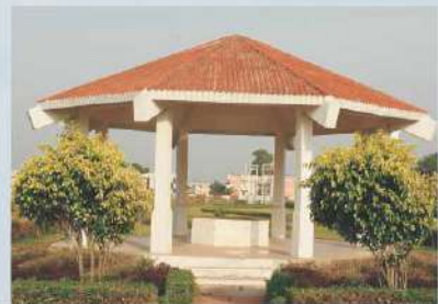
GAZEBO IN LAWN