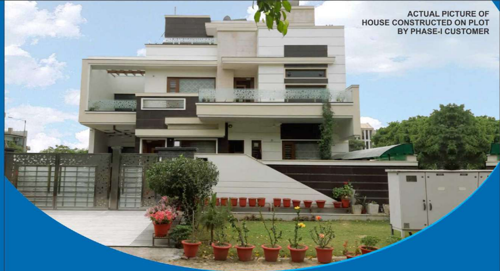
ACTUAL PICTURE OF HOUSE CONSTRUCTED ON PLOT BY PHASE-I CUSTOMER