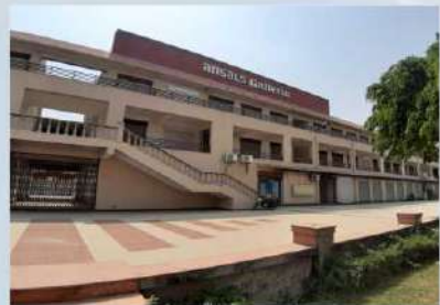
GALLERIA - COMMERCIAL/SCO