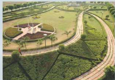
PARK WITH JOGGING TRACK