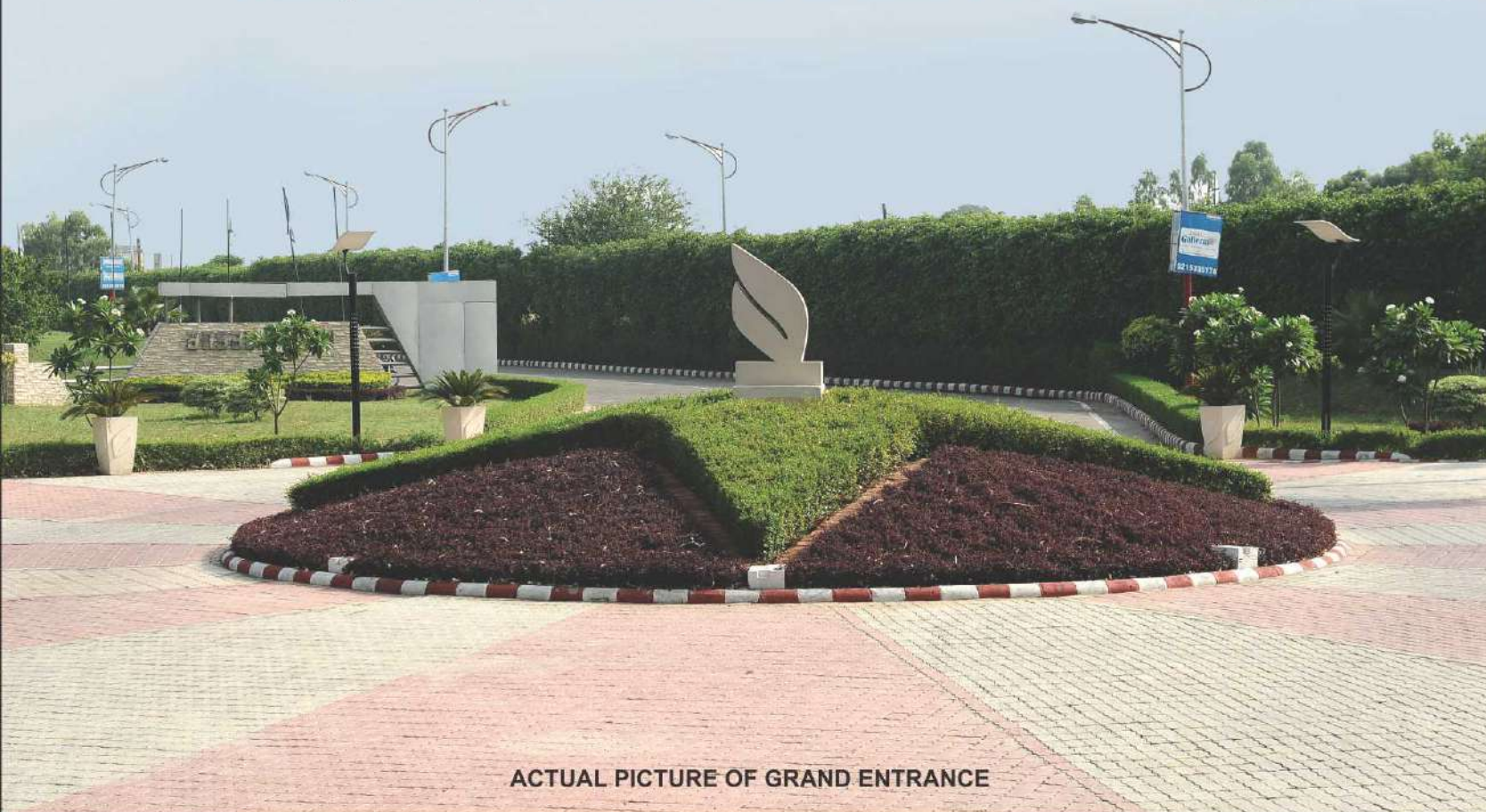
ACTUAL PICTURE OF GRAND ENTRANCE