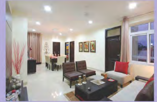
Reference picture only