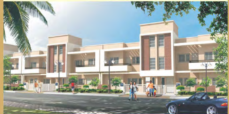
Perspective view of villas

So be it a beautiful bungalow or an expansive built-up house, Ansal Town will give you the opportunity to fulfill your dream.