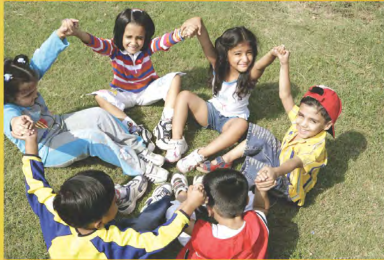
Reference picture only