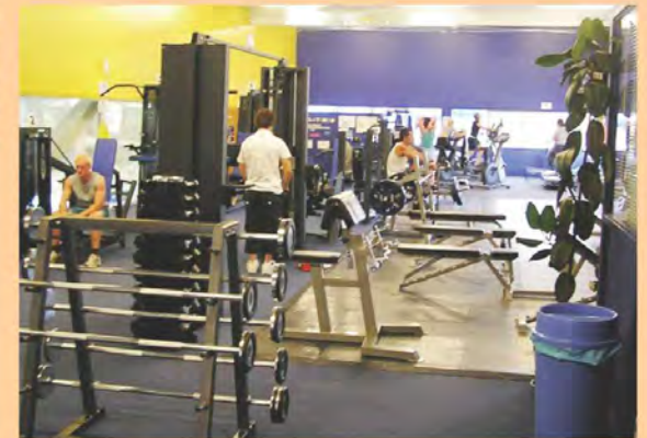
Reference picture only

The moment you enter the inviting premises of Ansal Town, Alwar you will get transported to a world of your dreams. Wide, landscaped tracts of green will invigorate your senses and the water bodies will make all the tension fly away. A modern in-house gym and a club with swimming pool will offer the best possible relief after a hard day's work.