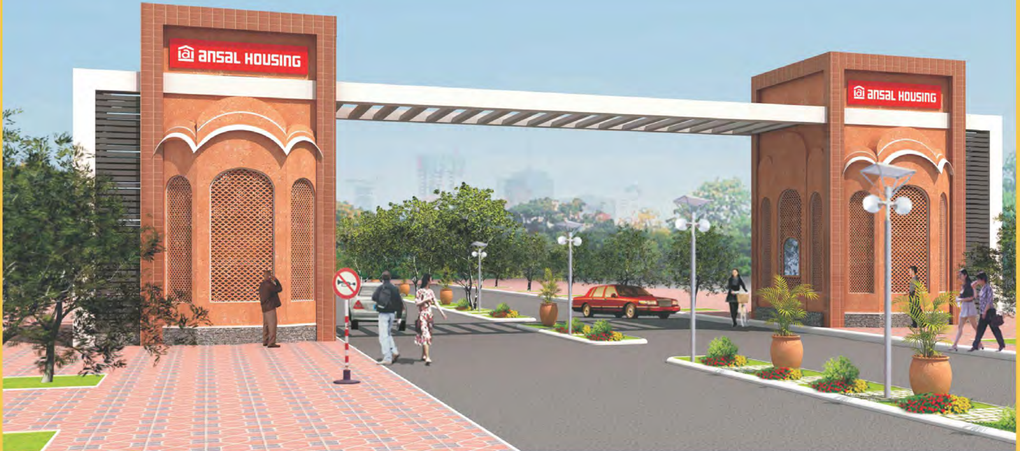
Perspective view of Entrance Gate

Nestled in the midst of the picturesque Aravali Hills, Ansal Town at Alwar signifies a fresh new wave of contemporary living. Conceptualized as a self-sufficient township with all necessary amenities, Ansal Town, Alwar is all set to become the most prized residential address in the city.