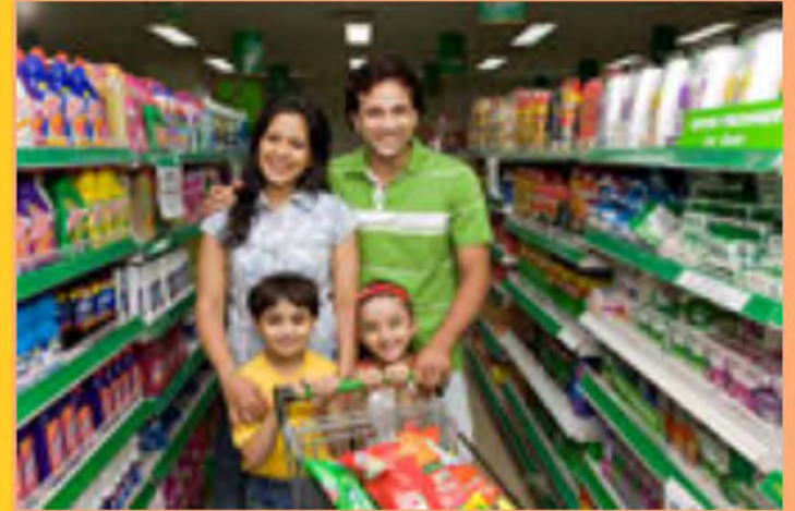
Reference picture only

Ansal Town, Alwar has a commercial area to meet your daily needs. Now you don't need to step far for your daily requirements.