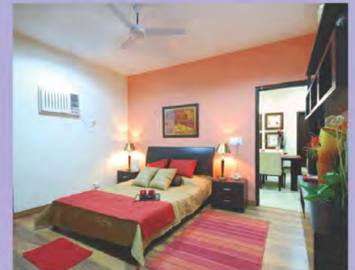
Reference picture only

Ansal Town, Alwar also offers you the option to live in a modern apartment. With well-ventilated spaces, a common dining area, balconies and a spacious kitchen, in addition to the bedrooms and living room, these apartments symbolize the way you see life.