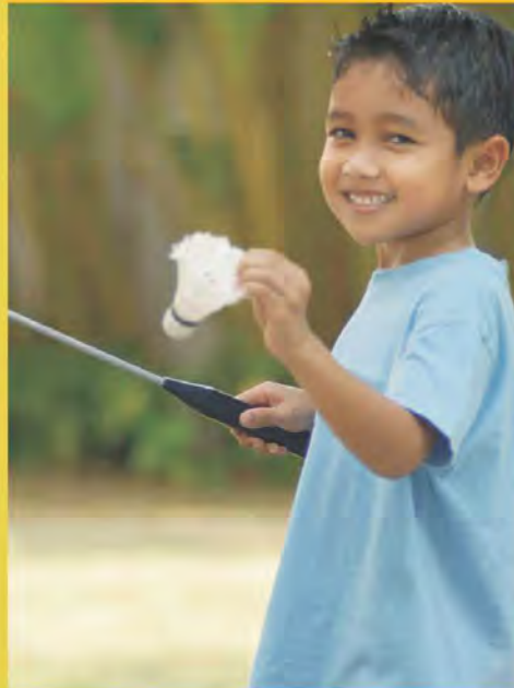
Reference picture only

Ansal Town, Alwar is designed keeping in mind the all-round growth needs of your kids. Well-maintained parks will offer them to mix with other children of their age within the township. There is an area earmarked for a school within the township to offer them quality education.