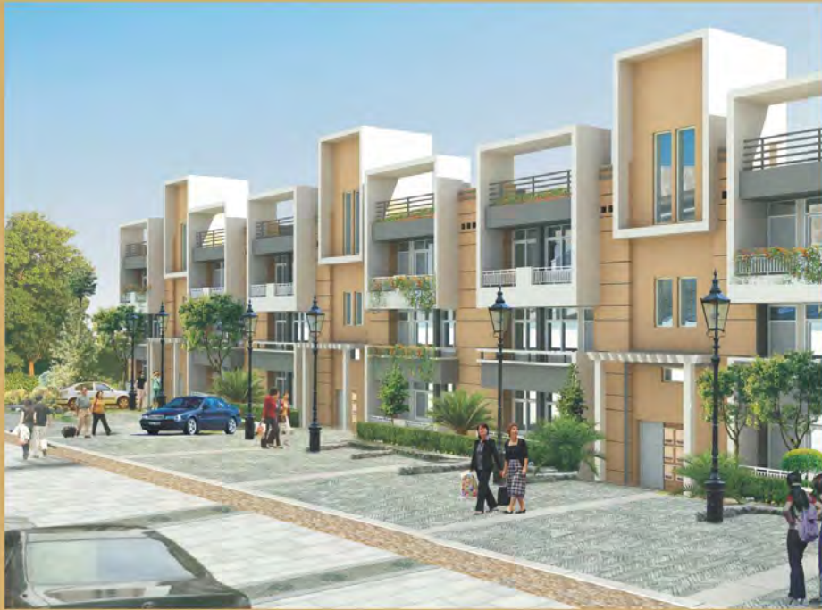
Perspective view of G + 2