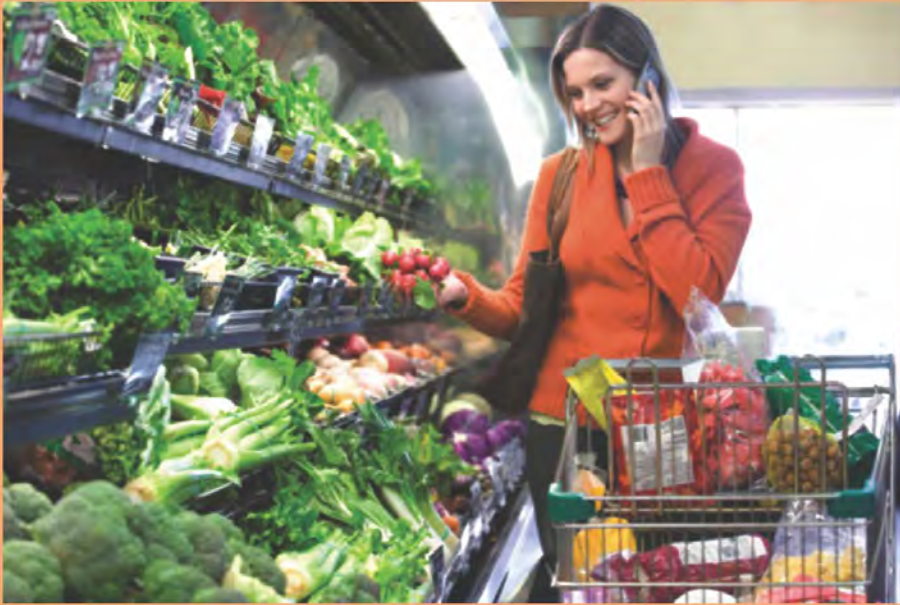
Reference picture only