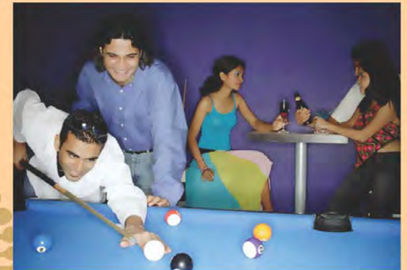
Reference picture only