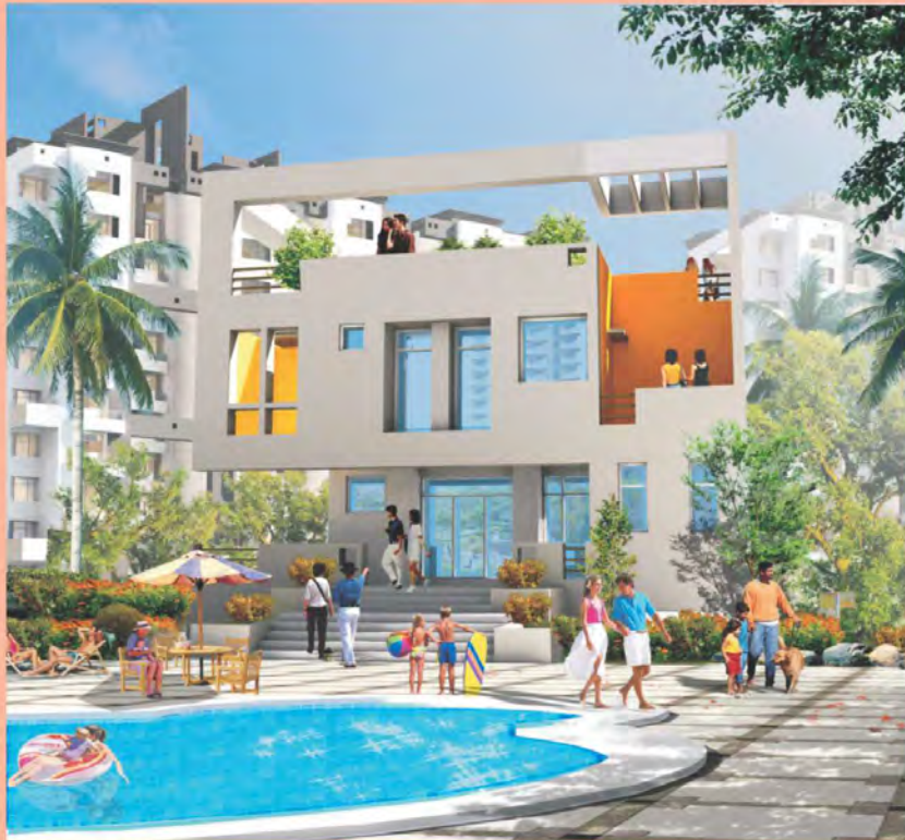
Perspective view of Club with Swimming Pool

ansal TOWN ALWAR STEP INTO MODERN LIVING