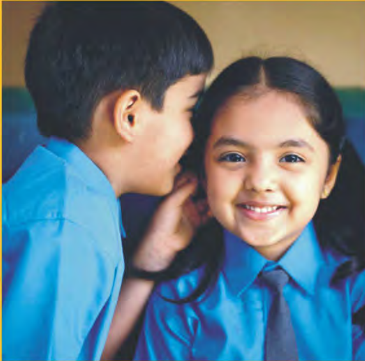
Reference picture only

Ansal Town, Alwar is designed keeping in mind the all-round growth needs of your kids. Well-maintained parks will offer them to mix with other children of their age within the township. There is an area earmarked for a school within the township to offer them quality education.