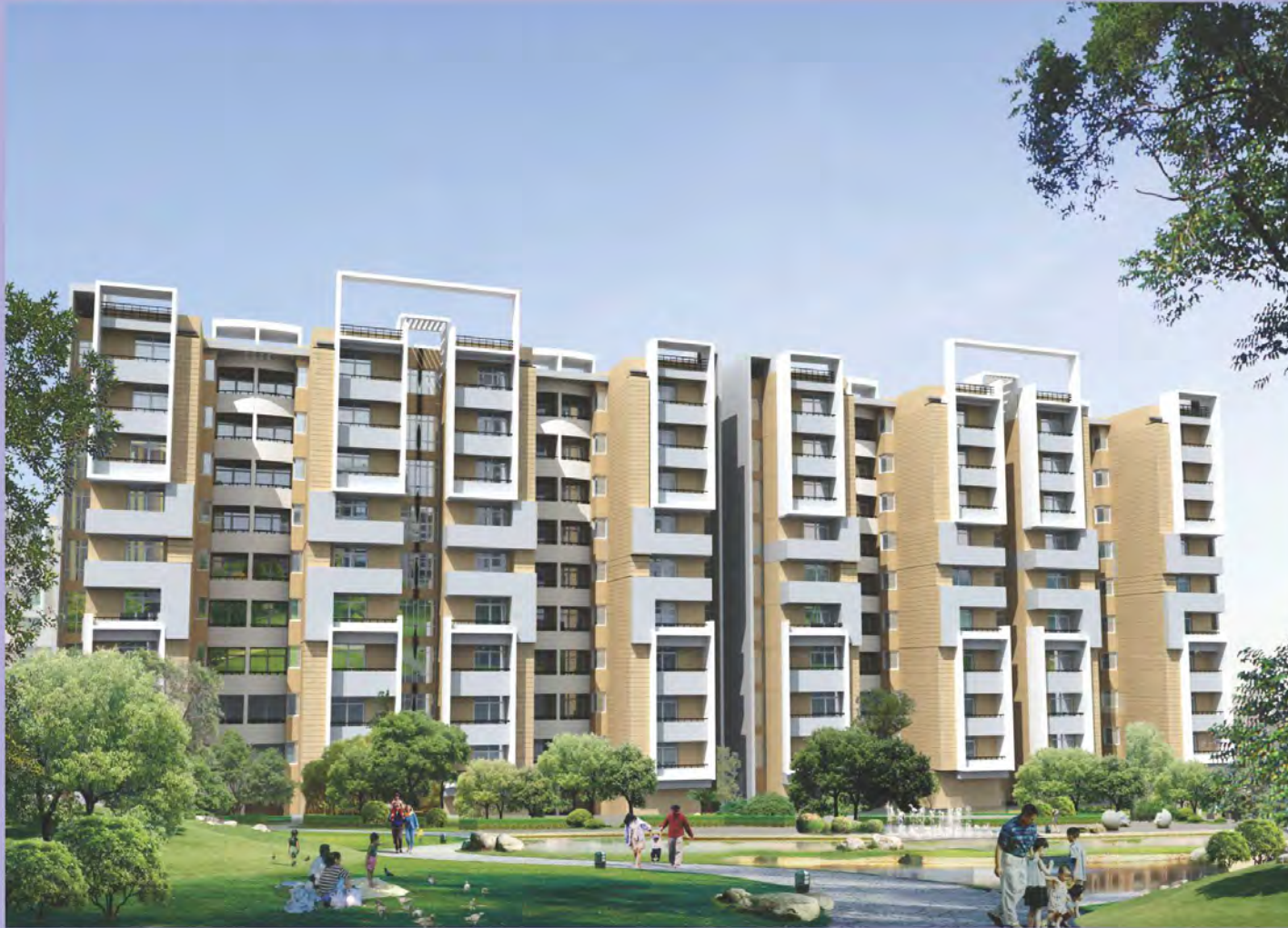
Perspective view of Apartments