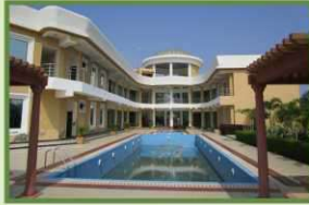
Actual View of Clubhouse