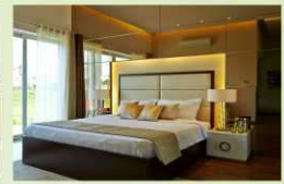
Actual Show Residence Views