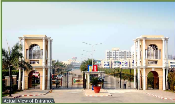
Actual View of Entrance