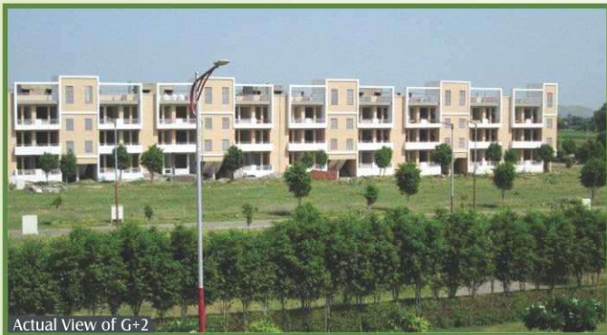
Actual View of G+2