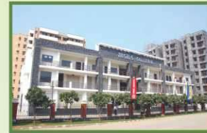
Actual View of Ansal's Galleria

On Delhi-Dehradun Highway (NH-58), near Modipuram Crossing