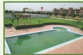
Actual View of Swimming Pool