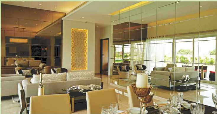
Actual Show Residence