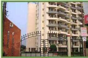
Actual View of Entrance Gate