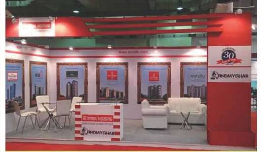
A view of Ansal Housing stall at "Find My Ghar" 28th Feb. to 2nd March, 2014