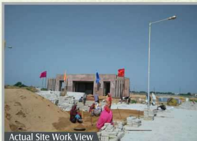
Actual Site Work View