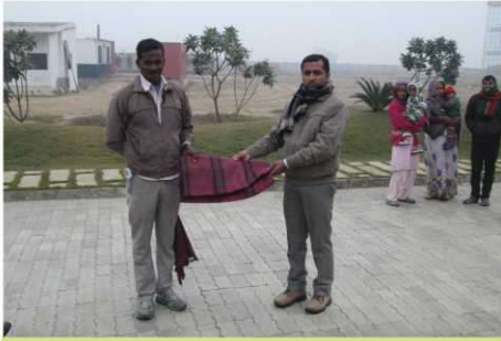
Blanket Distribution at ANSALS AMANTRE Site In Sector 88A, Gurgaon in Dec'14